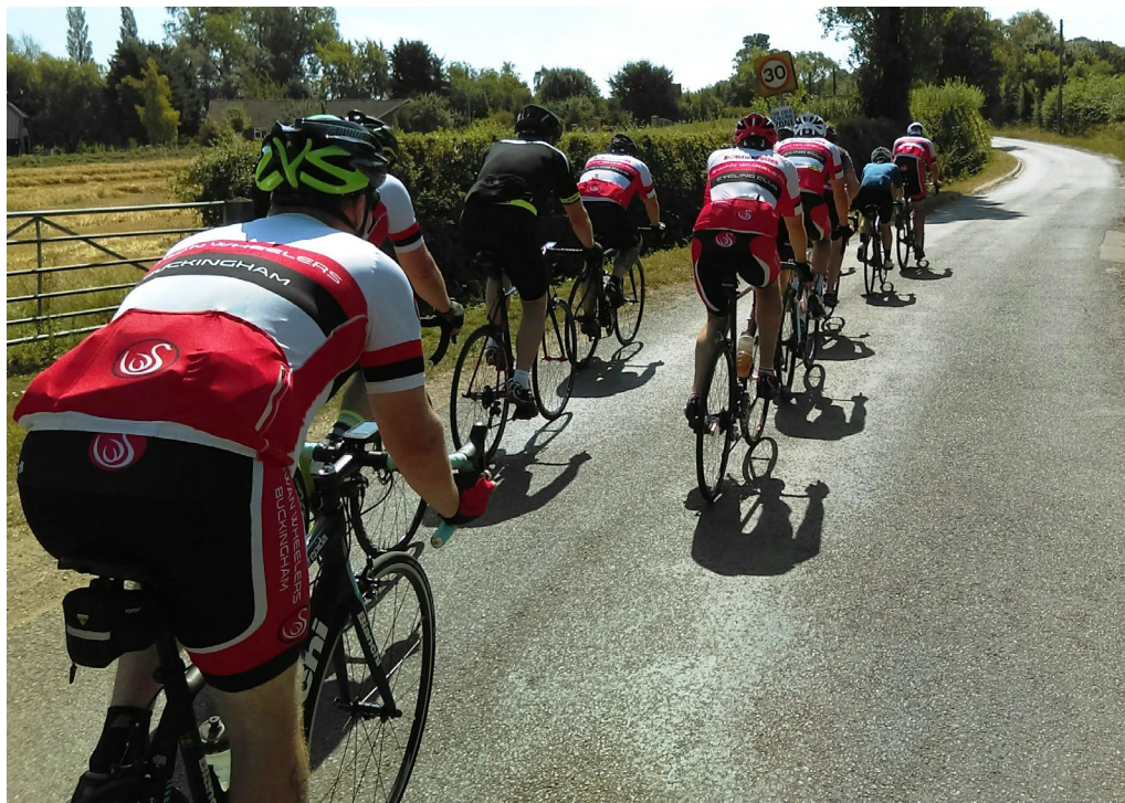
SWANNING AROUND – NOW WHERE IS THAT CAFÉ?