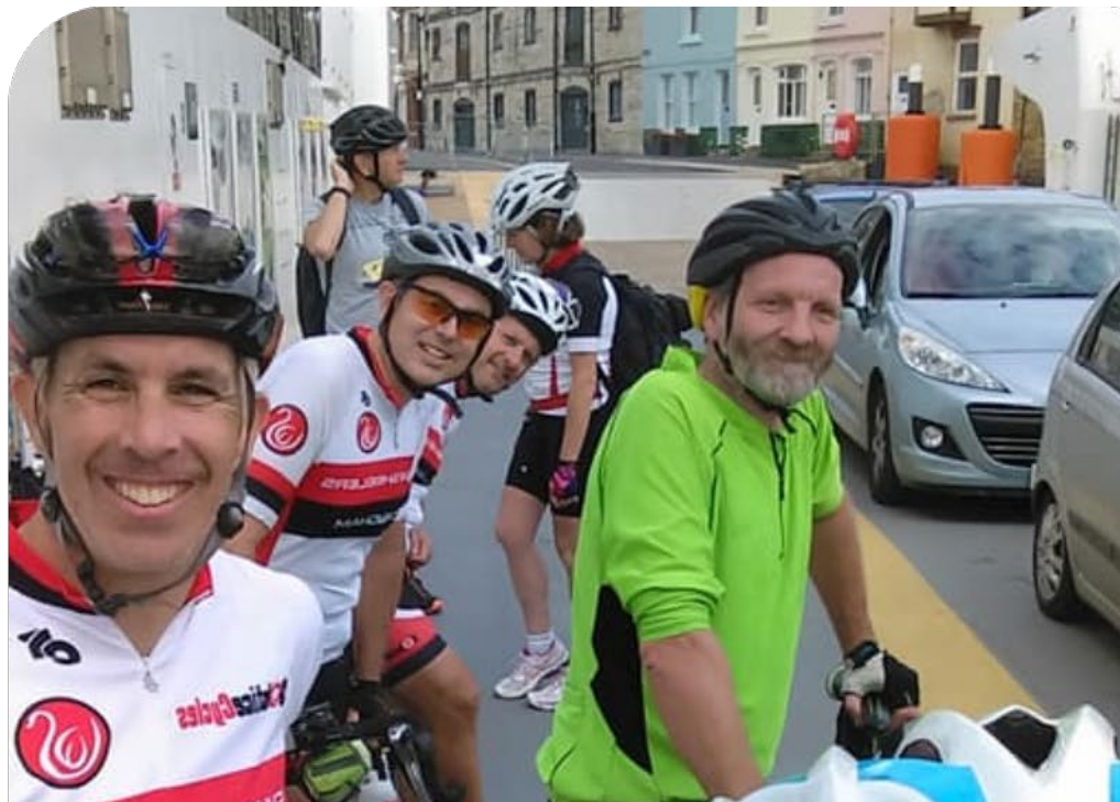
SWANNING AROUND – THE COWES FERRY AWAITS ON THE ISLE-O-WIGHT RIDE