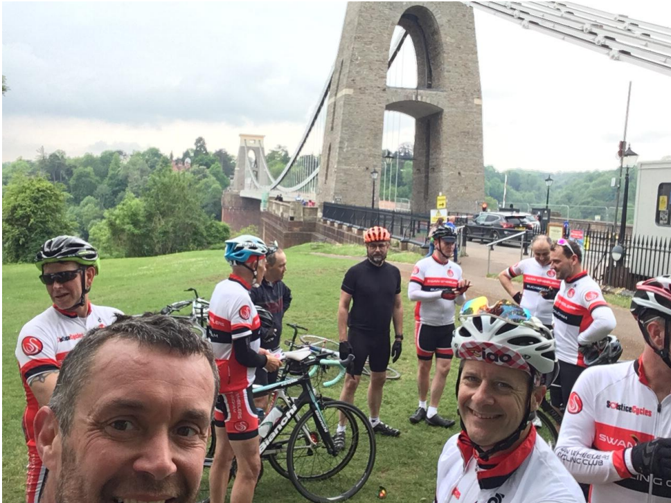
CHEDDAR GORGE RIDE END AT CLIFTON SUSPENSION BRIDGE